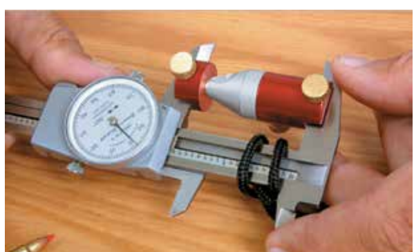
Caliper sold separately

Sorting rimfire ammo by rim thickness will identify ammo with similar ignition qualities so you can achieve improved accuracy. This proven technique is used by competitive shooters, target shooters and varmint hunters. The Hornady Rimfire Thickness Gauge attaches to your caliper (any style of 6" caliper) and includes bushings for use with all .17 and .22 caliber rimfire ammo. The gauge is also used to determine if any significant variations are present in a "lot" of ammunition. Ammo with less deviation in rim thickness should shoot more accurately.